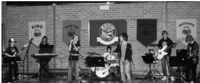
Class Act in action

BPS pop/rock band CLASS ACT performed for the first time before an enthusiastic audience last week at the Wideview School fete. The threat of rain re-located all entertainment into the hall, but spirits were not dampened and the band blew us all away with their awesome display of talent and professionalism. Well done CLASS ACT – we're so proud of you!